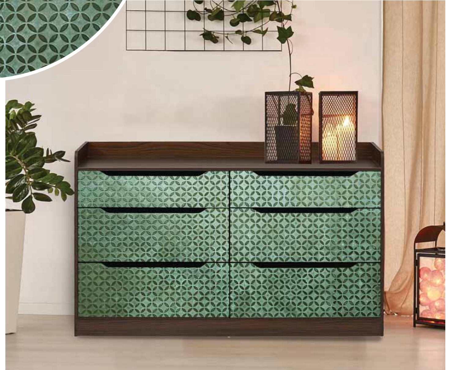
Brass 600 with Patina