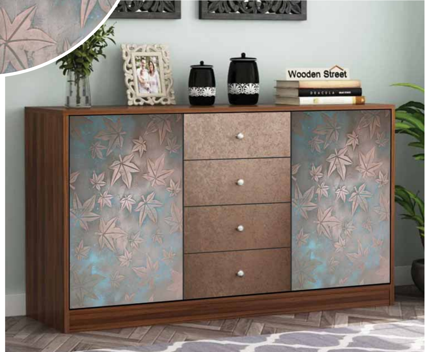
Copper 600/Copper 400